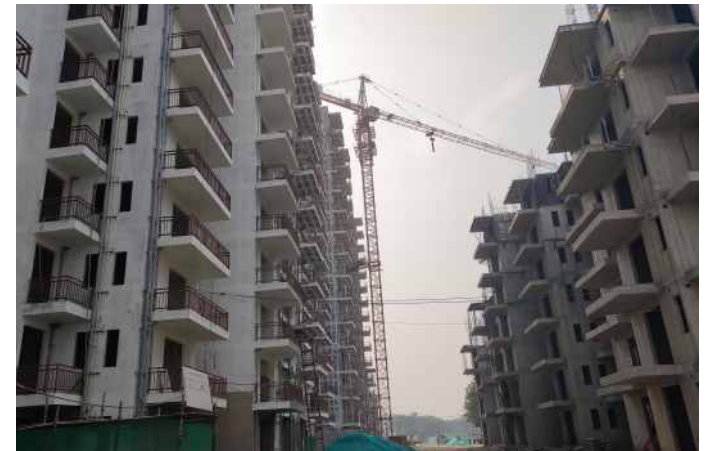
Actual Site Images