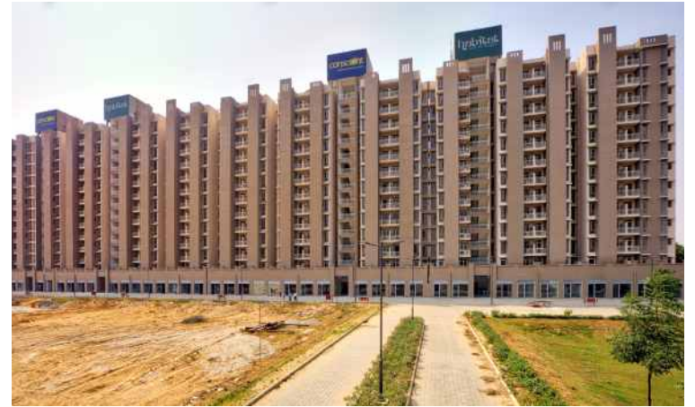
Actual Site Images